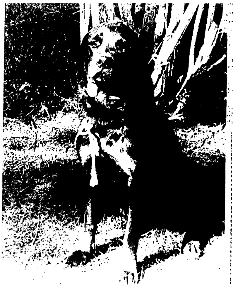
"Sam" was one of the many friendly animals who participated in PVA's Funday and Carnival.