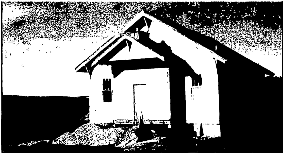
The Bridge School found a new home in 2003 on Otter Creek Road.