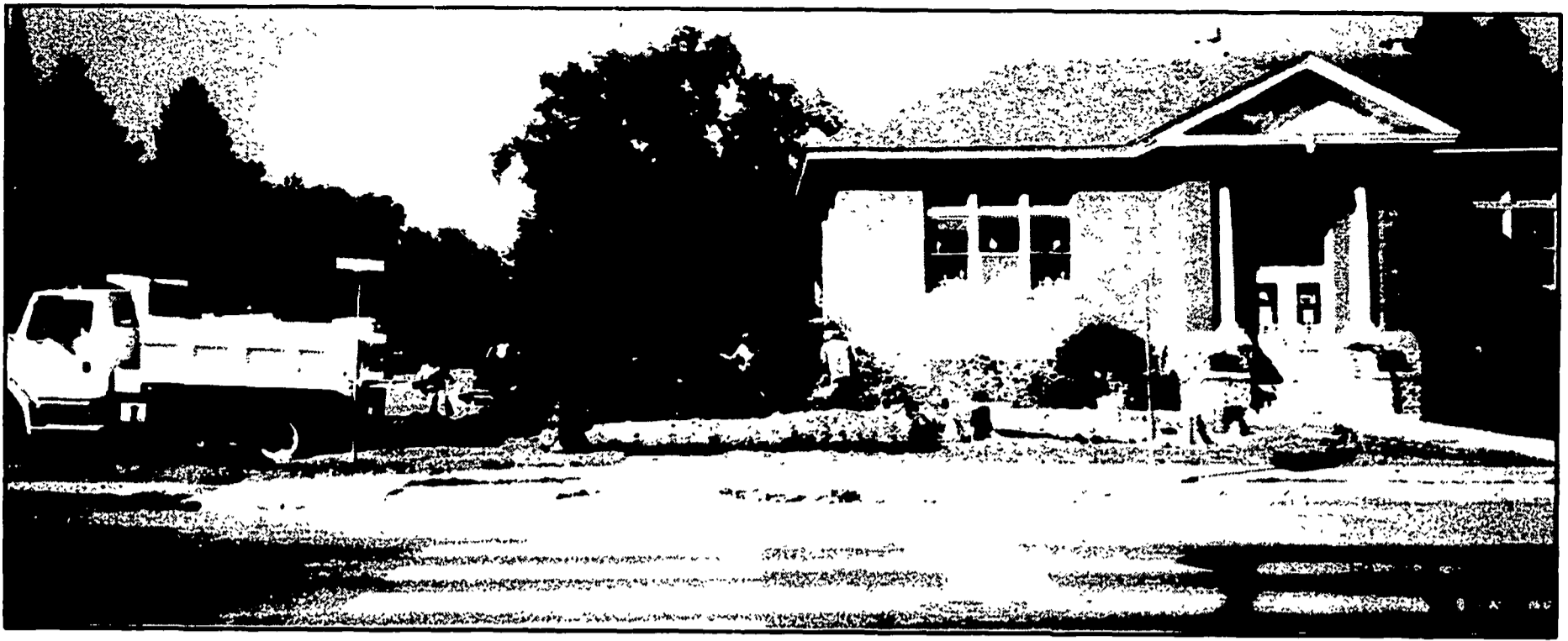
Many were saddened by the loss of the Memorial Trees at the Carnegie Library in July due to disease.