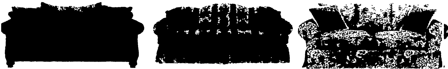
Large Selection: Sofa & Love Seat Sets By Comfort Industries Made In U.S.A. Life Time Spring & Frame Warrantes 2 Year Cushion Warrantes