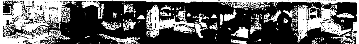
Queen Bed, Nightstands, TV Armoire (This Set Will Not Be Complete - Several Extra Pieces) Queen Bed, Dresser Mirror, King Bed, Dresser Mirror, 2 Night Stands, Queen Bed, Nightstand, Dresser Mirror, Chest & Armoire (Available in Oak and Mahogany)