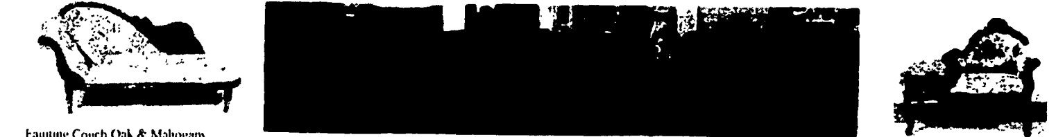
Reclining Couch Oak & Mahogany Top Grain Genuine Leather 3pc Sets Lifetime Spring & Frame Warranty Gossip Bench

AUCTION CONDUCTED BY: NATIONAL AUCTION & SALES MGMT VERN & RAY SEAL AUCTIONEERS / PH: 406-259-4730 CELL: 406-671-4520 TERMS: CASH, BANKCARDS OR GOOD CHECK