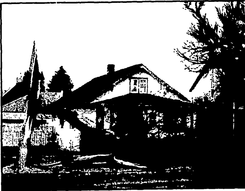
This tree on Fifth Avenue was no match for the high winds of November.

The first installment of a series of articles on the breakdown of the types of taxes Stillwater Mining Company pays and how they are distributed throughout the area covered