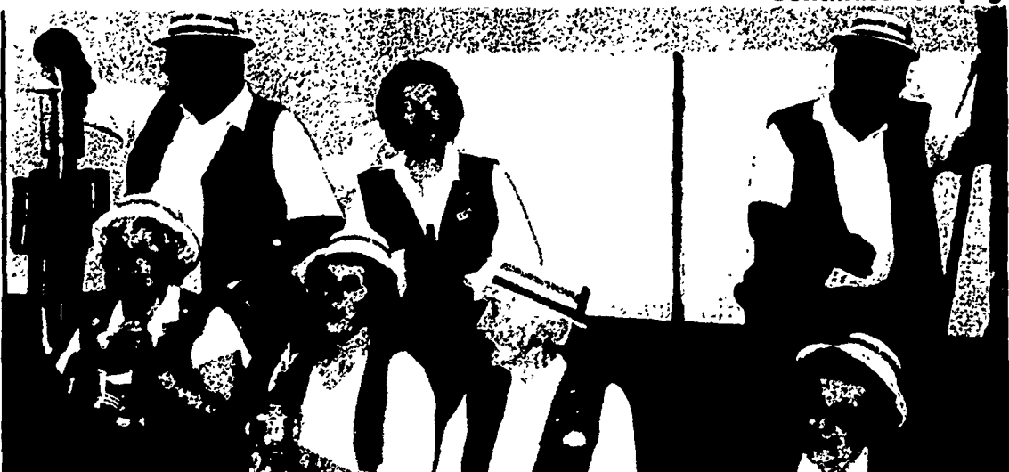
Members of the Hospitality House band are always finding something to sing about.