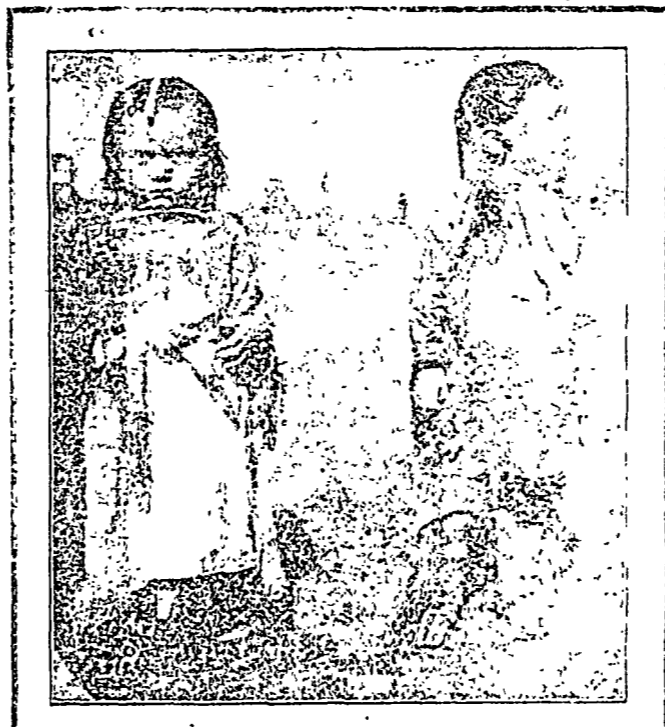
From the First Families of Montana.

"Mr. Editor: I received your dun today. Horetofore when I got a dun from you I threw it aside and forgot about it. I have just been making some calculations and I find that it has cost you 17 cents to dun me so far. That mouvy was thrown away, through my carelessness. I really didn't care much about your paper and that's why I didn't pay any heed to the duns. In your last dun just